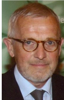
Dr. Francis Halzen

We have melted half of the eighty holes over two km deep in the Antarctic icecap to be used as astronomical observatories. Into each hole is lowered a string knotted with basketball-sized light detectors which are sensitive to the shimmering blue light emitted in the surrounding clear ice when ghostly particles called neutrinos pass through the Earth. These neutrinos are cosmic messengers from the most violent processes in the universe, for example giant black holes gobbling up stars in the heart of quasars, and gamma-ray bursts which are the biggest explosions since the Big Bang. Neutrinos will tell us if there are dark matter particles trapped in the heart of the Sun, and perhaps even reveal if there are additional dimensions in space.